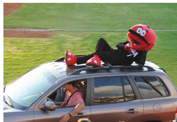
Looie atop a gently-used car last year.

We look forward to seeing you at the game!