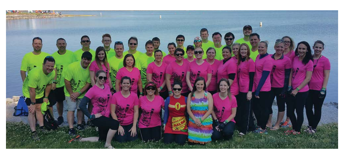
TVFCU employees gather for a team picture at last year's Dragon Boat Race to benefit Children's Hospital at Erlanger.

Friday, June 9-Saturday, June 17 Be sure to visit Riverbend Beach at this year's Riverbend Festival, which kicks off on Friday, June 9. TVFCU is working again with WDEF-News 12, SpringHill Suites and the Creative Discovery Museum to bring attendees Riverbend Beach.